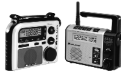
EMERGENCY CRANK RADIOS